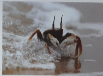
Left top to bottom photo : Siganus vermiculatus , Magil aphalus , Olive Ridley Turtles Right top to bottom photo : Acanthopagrus berda , Blue Murret Crab, Horned Ghost Crab Left page photo : Western Reef egret