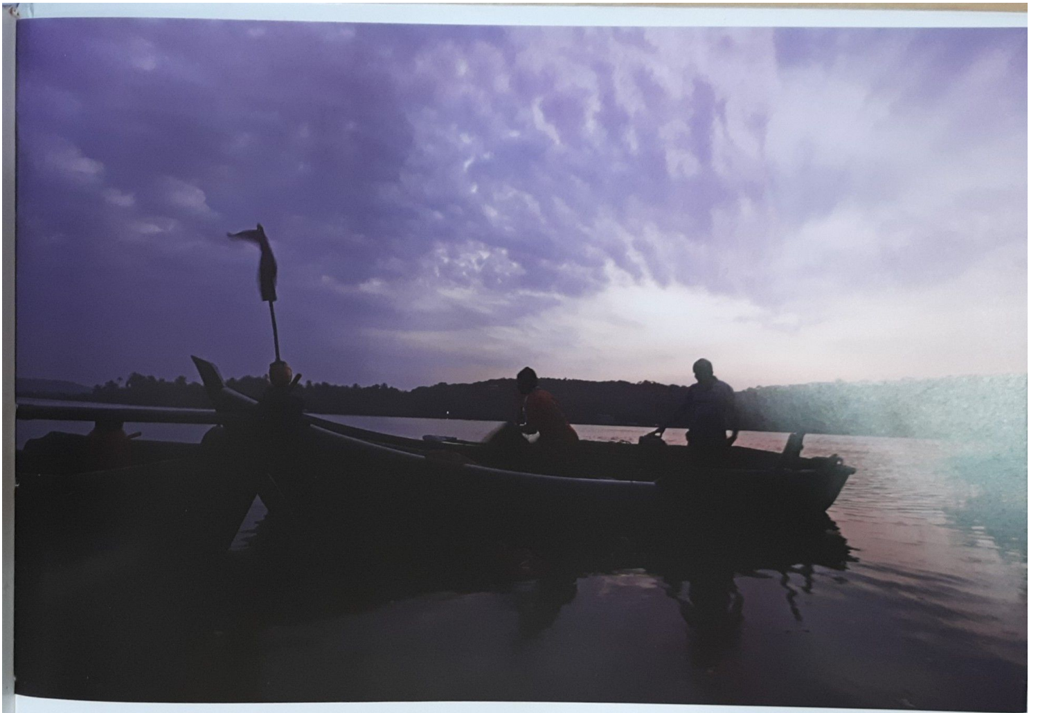
Left page - Top photo : Crab movement of the tide out to sea., Bottom left photo : Snorkeling, Bottom right photo : Dolphin Right page photo : Sunrise