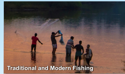
Traditional and Modern Fishing

Mangrove ecotourism developed under the 'Mangrove Conservation and Livelihood Generation' Scheme of the Government of Maharashtra implemented by Mangrove Cell and Mangrove Foundation of Maharashtra.